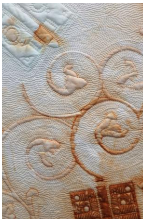
Detail image of artwork

Rusted Vines and Hinges is a continuation of the experimentation of using architectural ironwork to create surface design for textile wall art. Antique wrought ironwork, iron, and brass hinges from the 1800s are utilized in creating the images on this heavily hand stitched artwork. The brass hinge leaves a mint green ghost image in the upper left of the piece while the two iron hinges leave much more detailed and definite images on the lower right. Once again, the artwork is designed to be displayed in either a vertical or horizontal orientation which gives the work a new appearance with each change in display.