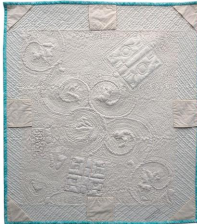
View of back of artwork